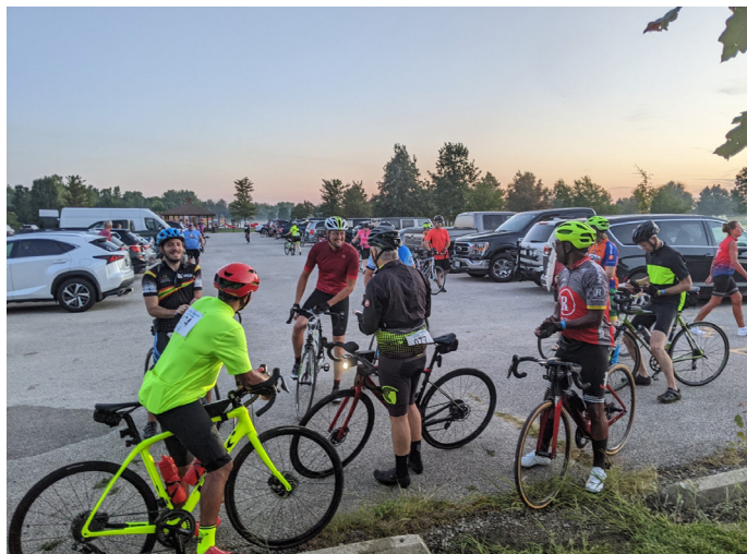
Riders getting ready to head out for their ride