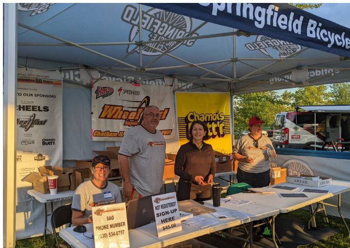
Volunteers at registration/packet pickup