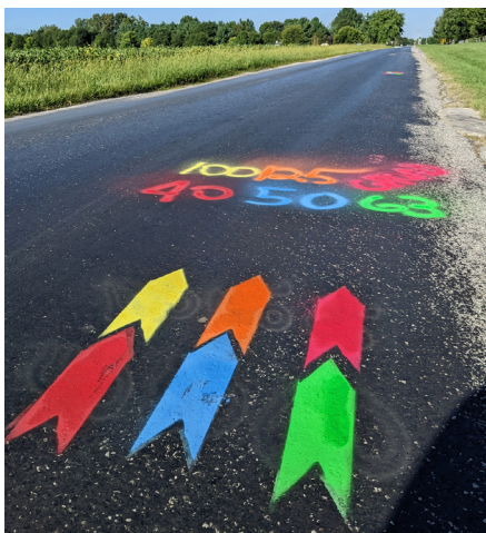
Well-marked routes helped keep riders on track.