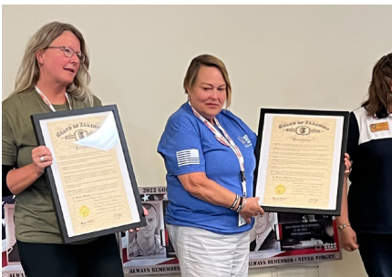
Gold Star Mothers at closing ceremony