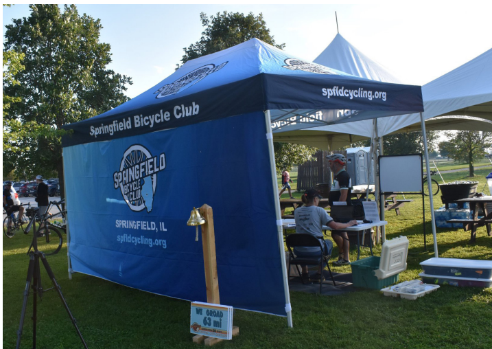
The new “club tent” served as a spot for riders to pick up packets or register on the day of the ride, and later as a photo booth