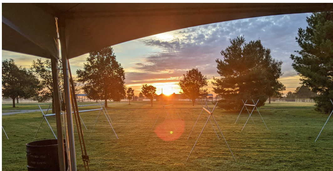
The sun rises at Centennial Park, site of the 2022 Capital City Century