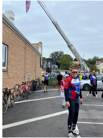
Stopover in West Dundee on Day 4