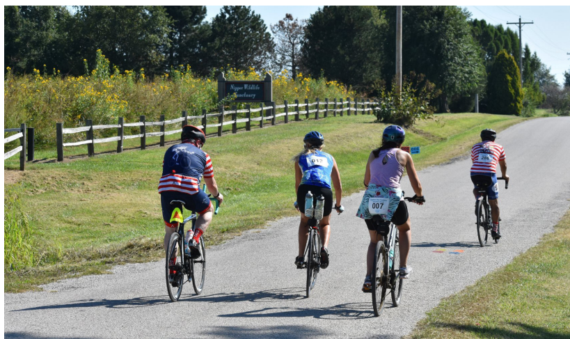
Riders passing Nipper Wildlife Sanctuary