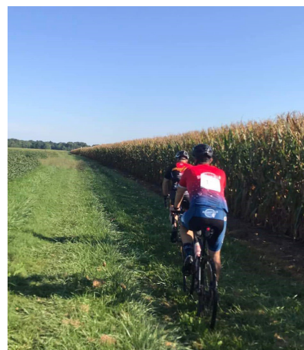
Groad riders slogged through the grass and ruts on Schramm Road. There may have been a spill or two in this section.