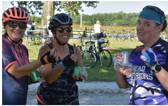
Left: Bacon-fueled smiles