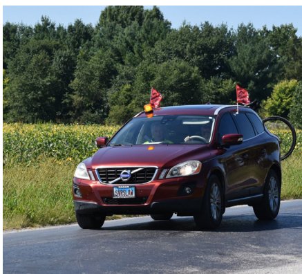
SAG drivers stayed busy all day.