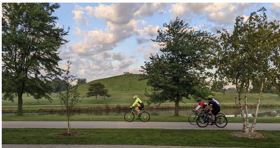
All routes started and finished at Centennial Park. Some chose to ride to the top of the hill at the end of their ride